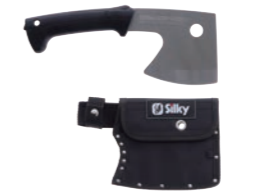
YOKI ..... 20