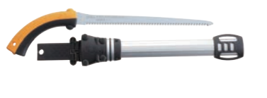
TSURUGI MEDIUM ..... 11