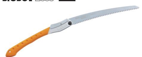
BIGBOY 2000 X-LARGE ..... 16