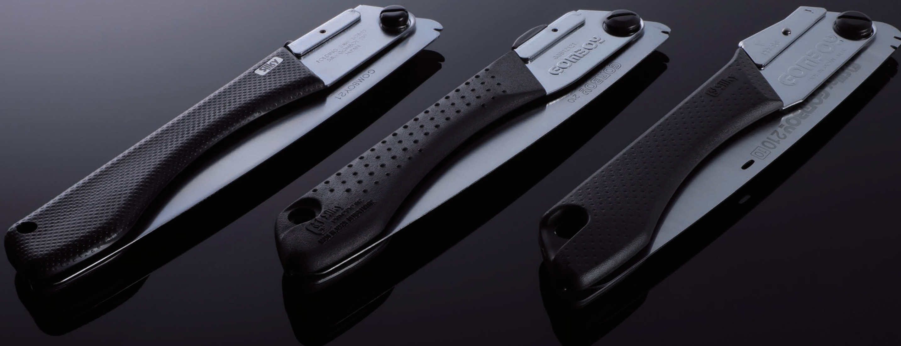
1st GENERATION 1985 -