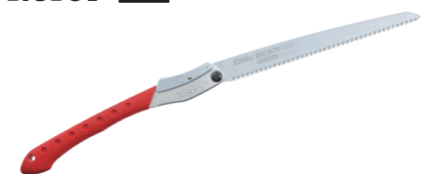
BIGBOY FINE ..... 16